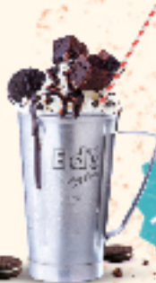
MUD PIE (V)