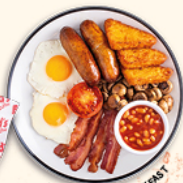
BIG ED'S FULL BREAKFAST