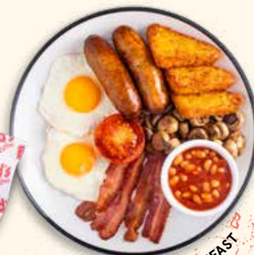
BIG ED'S FULL BREAKFAST