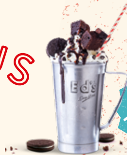
MUD PIE (V)